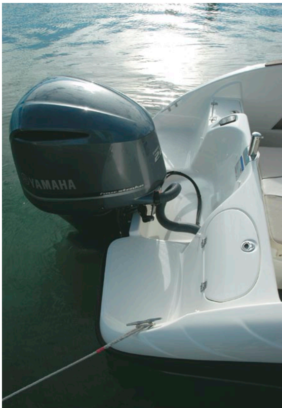
THE TRANSOM AREA FEATURES TWO STORAGE LOCKERS, ONE OF WHICH DOUBLES AS A LIVE BAIT TANK.

There are a couple of storage options in the transom with the port side bin able to be plumbed in as a live bait tank. A large GRP panel lifts up to reveal even more storage space under the aft deck area where there is room for a 15 litre hot water tank or somewhere to stow the Magna rod holder mounted BBQ. Our test boat also had an Engel 98-litre polybin complete with a top cushion, which I have in our 685 and it's certainly proved a great addition. You can toss in some ice to keep the catch fresh and also use it as a double seat.