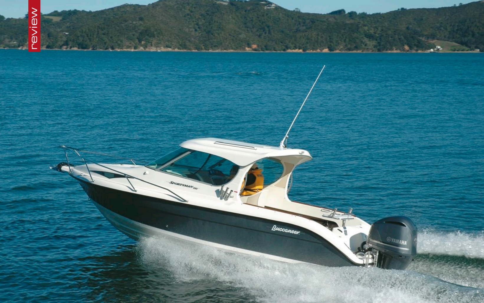
TOP: THE 735 SPORTSMAN IS IDEALLY SUITED TO THE YAMAHA 225, BUT WILL EASILY TAKE MORE HORSEPOWER.