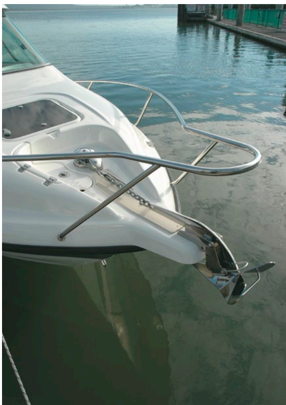
LEFT: THE AUTO ANCHORING SYSTEM MEANS YOU NEVER NEED TO GO ON THE FOREDECK.