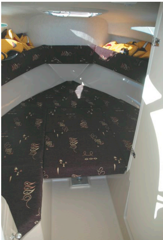
ABOVE RIGHT: WITH THE INFILL THE CABIN TRANSFORMS TO A HUGE DOUBLE BERTH.

There are deep moulded storage areas under the squabs, as well as in wide side trays. Aft is a small sink unit with an optional water pump and a storage locker beneath. If you plan to do any cooking aboard then the best set-up is a stalk-mounted BBQ or one that sits on the bait station in the cockpit. Small enclosed cabins like the 735's are hardly conducive for cooking inside. The 735 has a completely lockable cabin which provides extra security when leaving the boat unattended.