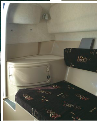
ABOVE: THE ENGEL POLYBIN MAKES A GREAT FISH LOCKER.