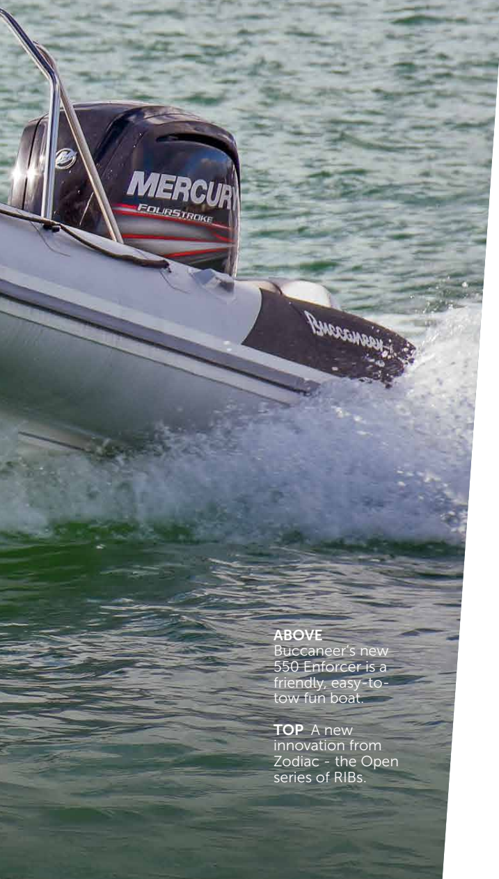
ABOVE Buccaneer's new 550 Enforcer is a friendly, easy-to-tow fun boat.