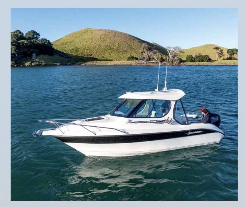
ABOVE Buccaneer Boats has managed to make its smallest hardtop look good from every angle.

\ensuremath{\text{LEFT}} Wintry conditions on test day – thank goodness for the snug hardtop.